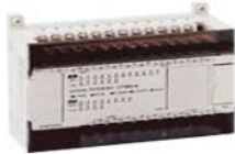
CPM2A Series PLC