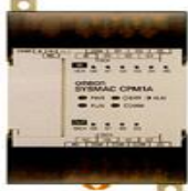
CPM1A Series PLC