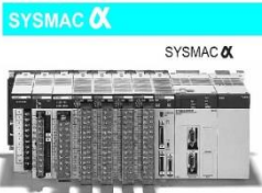
C200H Series PLC